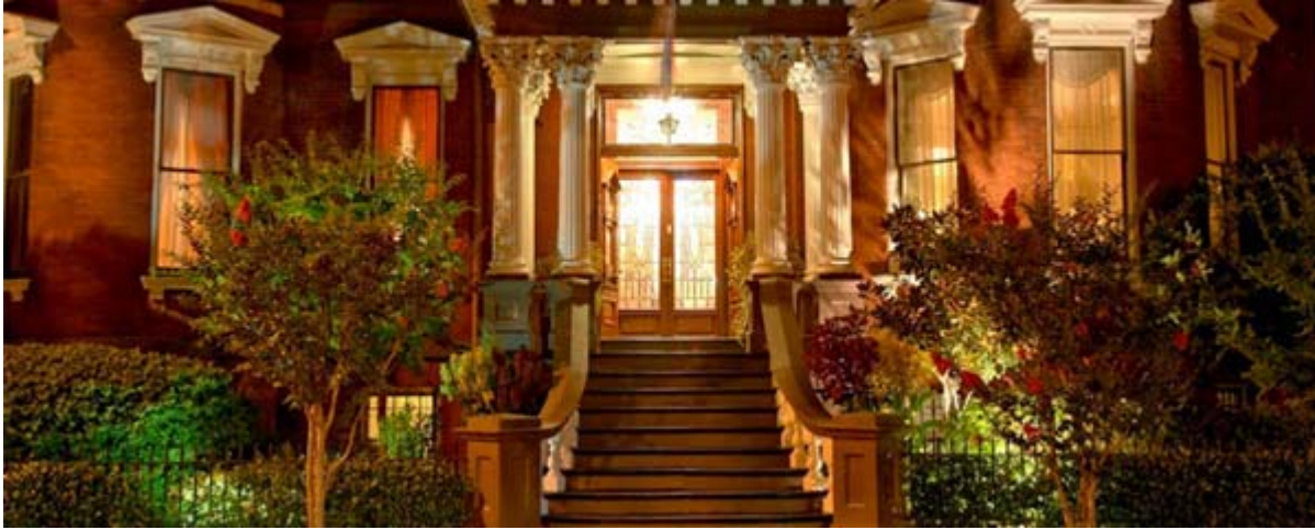
The Kehoe House is a prime example of Savannah's townhouses-turned-inns.

Choose from historic inns to stylish, modern boutique hotels when you stay in Savannah.