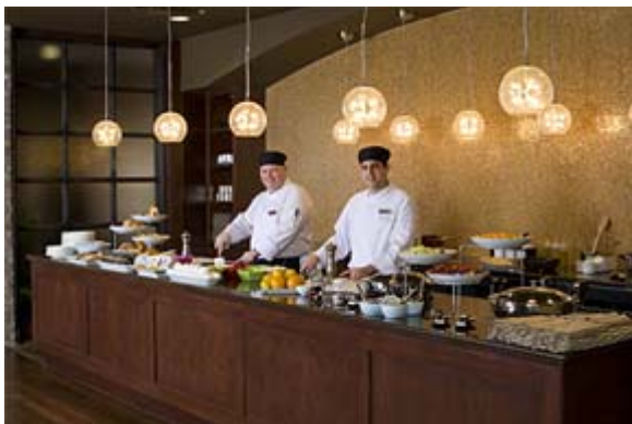
Grab a hearty breakfast from the kitchen buffet at Avia Savannah.

In the basement, there's a meandering, rock-crystal fantasy of a spa. In the restaurant, where the décor is equally eccentric, a pianist plays a Bösendorfer grand. The kitchen houses a cooking school. In the hallways, there's a collection of contemporary art.