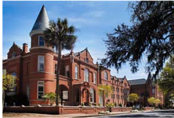
Find modern luxuries and design within the century-old walls of the Mansion on Forsyth Park.

The Thunderbird Inn is a motel built in 1964. It still has its flamboyant original sign and colorful decorative plastic panels outside. Within, it's been refurbished in a modern style. Rooms have big-screen TVs, free Internet connection and refrigerators. There's ample free parking. Don't be surprised if on check-in they hand you a couple of Moon Pies. (That, for the uninitiated, is a retro Southern candy that will make your teeth ache.) Rooms from $109 per night for double occupancy. 611 W. Oglethorpe Ave. Tel. 912-233-5551. thethunderbirdinn.com